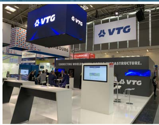
The VTG stand and the calm before the storm.

VTG also presented a new predictive maintenance pilot project in Sweden, working with Trafikverket, that can detect damaged wheelsets before they cause any downtime.