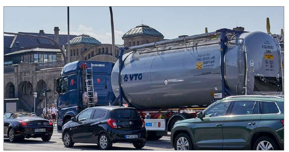
Each ground operated tank container can carry four tons more jet fuel compared to using only road transport.

This holistic service offered by VTG is yet another example of the potential of modal shift, which benefits customers and the environment alike.