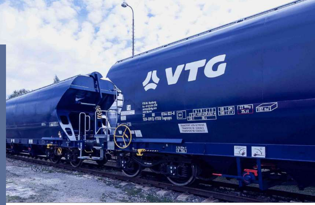
VTG Connect - revolutionising the way information is gathered about wagon condition, status and location.