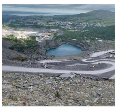
A head for heights - a birds eye view of the 1.5km zip line challenge at Penrhyn Quarry.

Velocity 2 is the fatest zip line in the world and the longest in Europe and our intrepid group reached speeds of 100mph as they zoomed for 1.5km over Penrhyn Quarry Lake for a good cause.