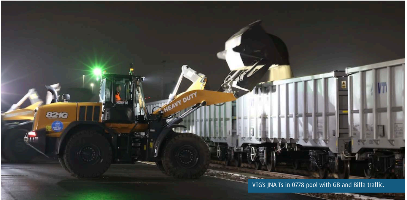
VTG's JNA Ts in 0778 pool with GB and Biffa traffic.