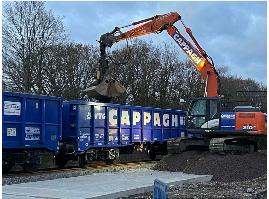
Words by David Fletcher.

For the first time in over quarter of a century rail freight has returned to Chessington South. The former household coal distribution depot in South West London last saw rail deliveries from the British coalfields but now the site has a bright future supporting the construction industry. A 12 month programme by Wimbledon based Cappagh Group has seen years of tree growth replaced by a kilometre of new railway for the handling of aggregates. The site received the first train on the 10 December 2021 operated by DCRail using a short test rake of JNA-T wagons. Regular services are planned to start in January 2022 to serve Cappagh Group Infrastructure and utility customers in South West London and Surrey.